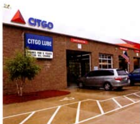
Eye candy at Citgo fast lubes.

This broadens an existing relationship between Leominster, Mass.-based Monson and Germany's BASF. Monson also distributes lubricant additives from Ciba, which became part of BASF in 2009.