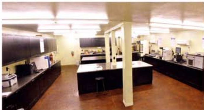
Smitty's new lab

For your own free subscription to Lubes'n'Greases , visit www.LNGpublishing.com